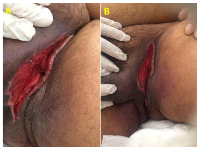
FIGURE 03: Both images represent revision of the surgical approach. In A, note that necrotic tissue and fibrin were removed. In B, photo taken in the 7th PO of revision, immediately before the advance flaps plastic surgery. Note border perfusion, absence of secretion or fibrinoid tissue.

On the 8th postoperative day, the patient was taken to the surgical center by the plastic surgery team to close the lesion, but the procedure was not done due to the presence of purulent secretion and necrotic sites in the wound. A new debridement was prescribed and performed the next day. After the latter approach, the surgical wound evolved well, with the absence of secretion and with granulation tissue, making it possible for the reconstruction of the left inguinal region with local flaps of advance to occur after 8 days.