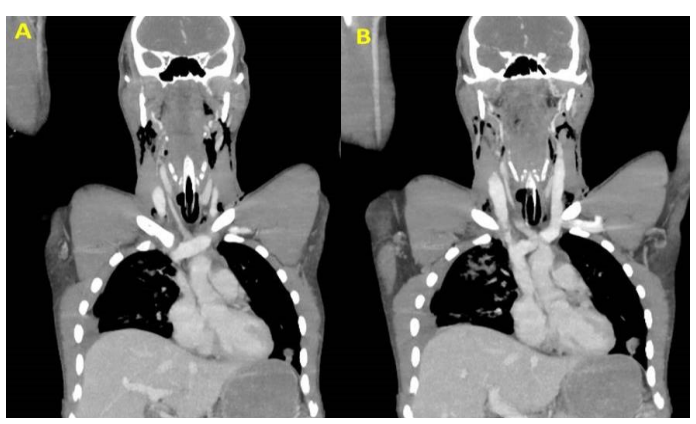
Figure 02: It is observed that tracheal path is irregular, suggestive of injury and transfixation of projectile