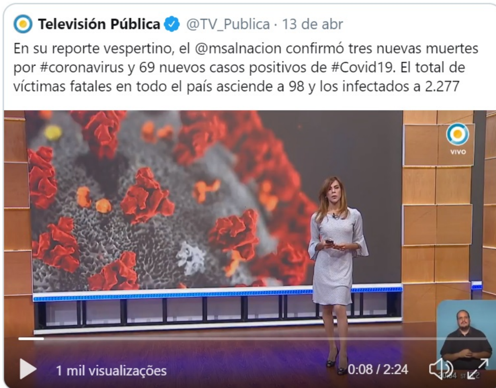
Figure 1: Diana Zurco, at Televisión Pública , from Argentina