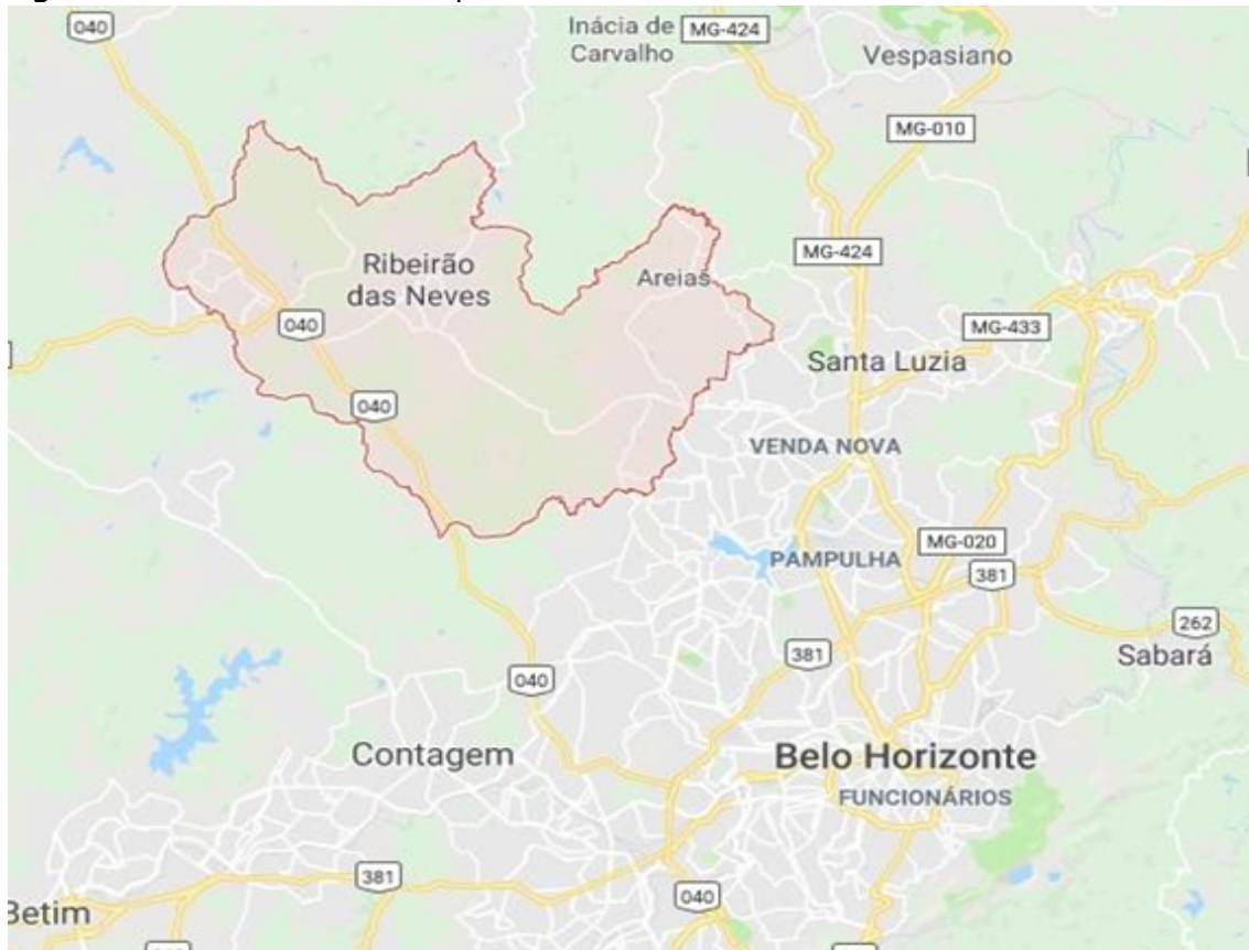
Figure 2 Ribeirão das Neves maps