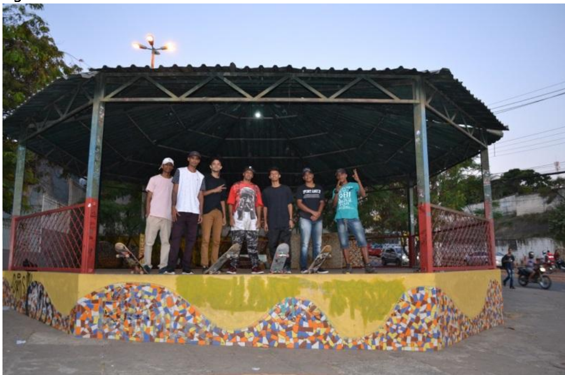
Figure 8 Just Crew Skateboard