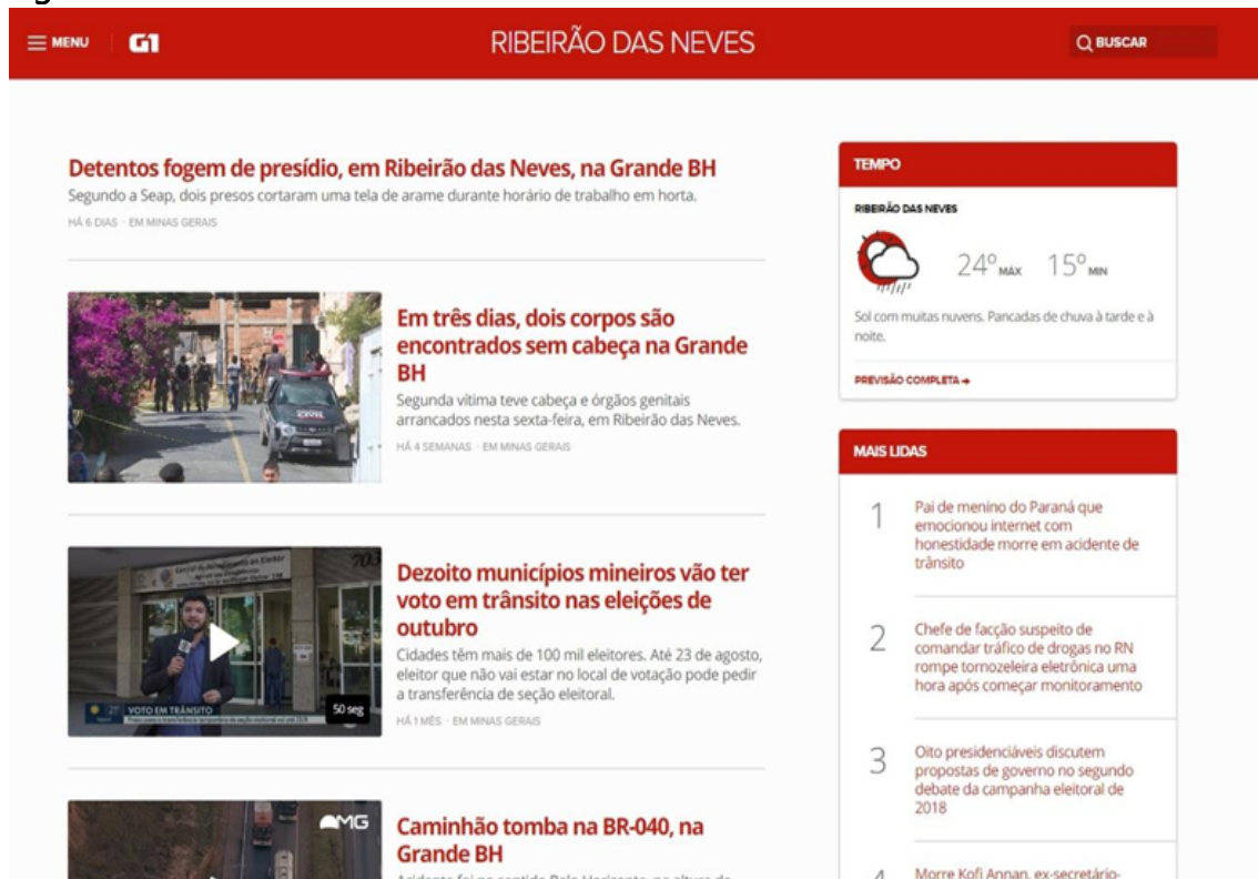
Figure 7 Ribeirão das Neves on the G1 Notícias Portal

The news site G1.com, of national and international scope, for example, does not escape the ranking of the most searched topics when the keyword is Ribeirão das Neves: