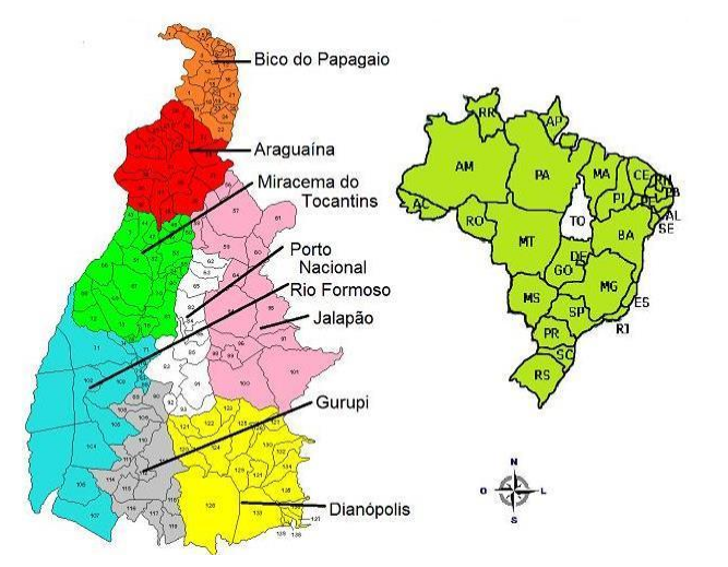
Figure 1 Map of Tocantins with Miracema do Tocantins location

Source: Image from www.google.com.br. State of Tocantins. Its location in Brazil and its microregions, highlighting the municipality of Miracema do Tocantins, access on February 6, 2019.