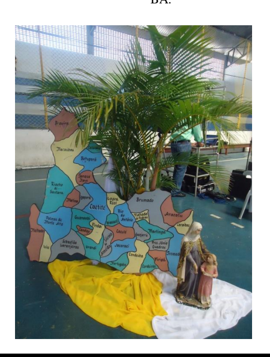
Figure 5 - Photo of the 25th Anniversary of the Pastoral Care of the Child in the Diocese of Caetité / BA.

In this way, literacy practices take shape, they materialize in the various literacy events that the women leaders of CEBs participate in every day. The texts multimodal, among them those portrayed in Figures 4 and 5, presented at the commemoration of the 25 years of the Pastoral Care of the Child in the Diocese Caetité/BA provided interaction of participants between the and their interpretative processes.