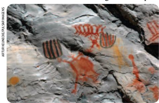
Figure 8 – Rupestrian paintings - LDH 1.

However, some images present in the LDH 1 seem to be simply laid out on the work at the criterion of illustration (picture-illustration), making it unnecessary the presence of the same to the understanding of the texts. In some cases, is not made available for certain images the methodological feature appropriate to the interpretation of the same, that is, it is not proposed any activity that can involve the interaction in the classroom, such as is the case of the image (Figure 8) used when the subject of the text is the homo's sapiens (clever man, who knows, you can know):