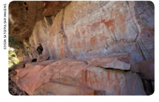
Inscrições rupestres próximas do Complexo do Janelão entre Itacarambí e Januária, norte de MG.