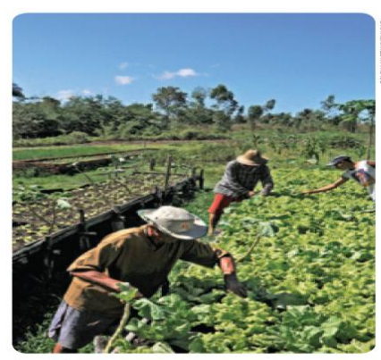
Figure 9 – Different territories – LDH 1.

In the texts about territory, the LDH 1 also presents images that make it possible to take the students to understand that, in the countryside, there are different forms of occupation of the land. Figure 9, for example, brings the differences between the territories of the peasantry and agribusiness: